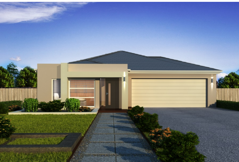
Facade shown for illustration purposes